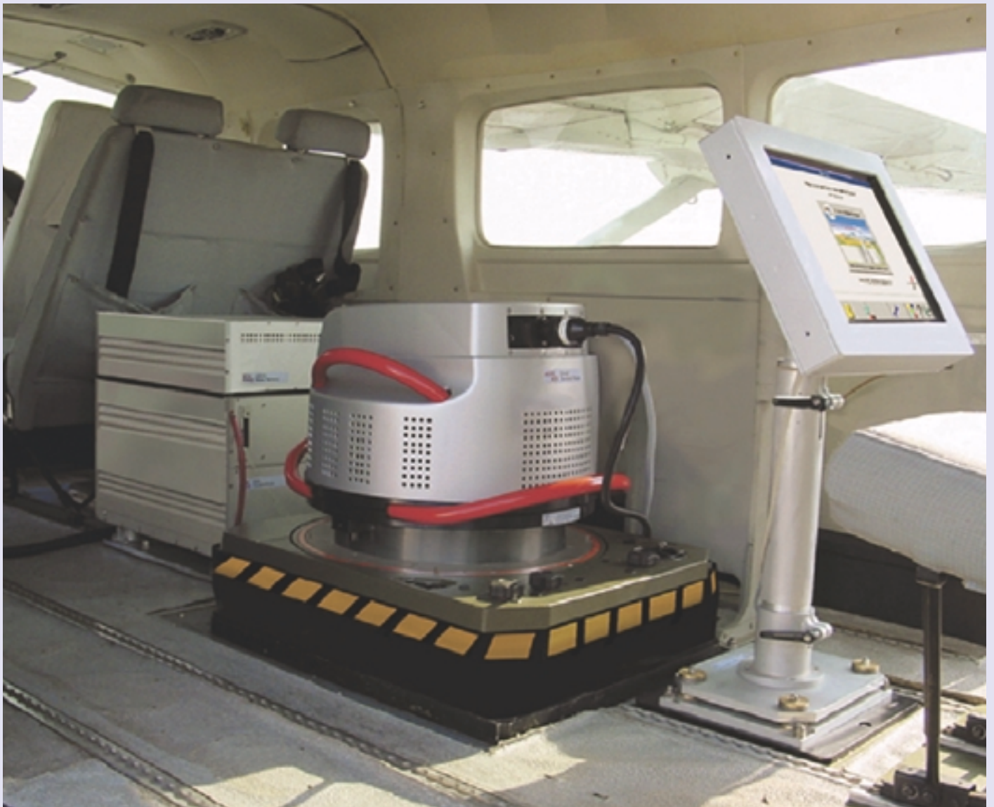
Fig. 2: The production version of the new ADS40 airborne pushbroom scanner installed in an aircraft.

(b) Supply of Digital Map Data. An account of the provision of digital map data to the private sector was given by Mr. Wong Chang Hung. The available map data, together with the corresponding textual data bases containing names, addresses, etc. has been derived from the standard maps at 1:1,000, 1:5,000 and 1:10,000 scales. The digital map data is supplied in native ARC/Info format with accompanying conversion routines. It is distributed in a variety of ways. (i) The first involves its direct supply by the Land Information Centre, purchasers receiving a simple licence giving the right to use the data on a non-transferable basis. (ii) The second method involves digital map re-sellers who advertise and sell the data to users who purchase the right to use the data. (iii) Value Added Re-sellers (VARs) re-package the data, adding their own data, with the government receiving a 15% royalty from the sale. (iv) An Internet Map Permit allows the use of raster map graphics (but not vector map data) on Web pages, again on the basis of a royalty fee.